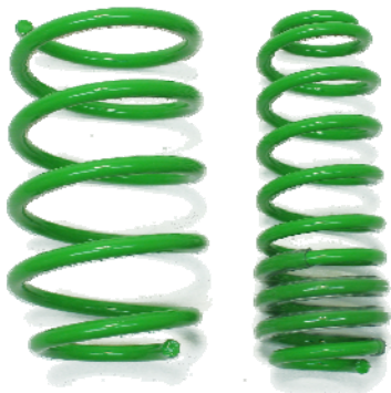
Actual product may differ from what is shown

Developed for extreme performance, featuring aggressive lowering combined with exceptional ride quality.