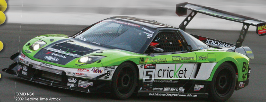
FXMD NSX 2009 Redline Time Attack Unlimited RWD Class Champion